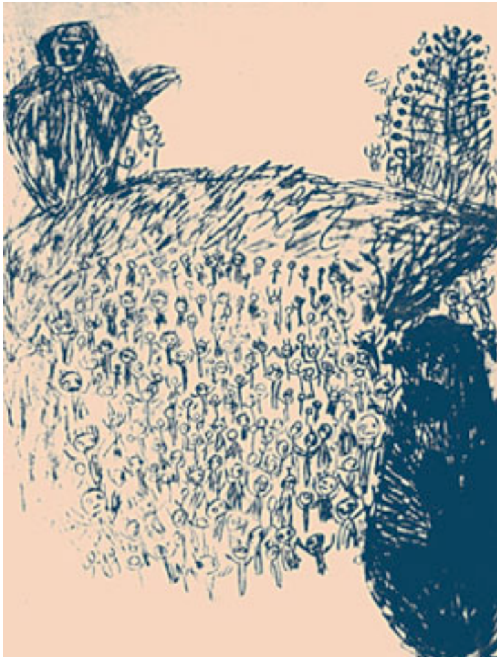
Australian Aborigine Great Mother and her flock of spirit-children waiting for birth. p. 276, Cosmic Cradle

"The Aboriginal world is essentially a spiritual world, and material acts are invested with a spiritual significance.