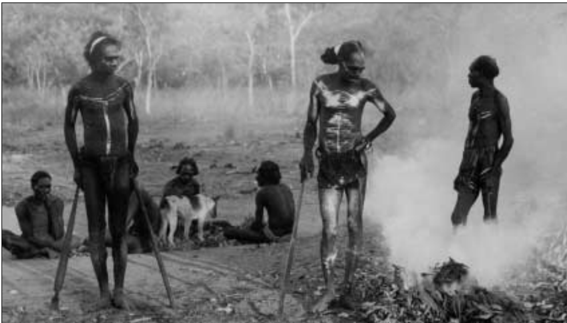
Aborigine dance and initiation.

The Ungarinjin were already initiated and most of the Worora were, while some of them and the greater part of the Unambal were still awaiting admission. Secrecy and awe penetrated everything in connection with this new and powerful cult. Special initiation was necessary also for us and was offered only after months of daily contact. We were initiated into the Kurrangara cult at a place called Wurewuri, which was not too far away from the modest hut of the old trapper south of the Prince Regent River. As the cult had to take place in the vicinity of white settlements, this place was the one nearest to the Unambal and all the dances and initiations were celebrated there. The members carefully explained to us that the slabs were endowed with an enormous power, a sort of poison with which the initiated had to be filled gradually by rubbing his body with smaller slabs lest he would die. When fully initiated a member radiated this power and had to clean himself carefully after each ceremony.