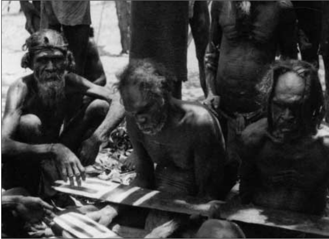
Examining slabs. Photo Andreas Lommel 1938

At the Kurrangara dancing ground at Wurewuri were assembled Unambal men with Ungarinyin from Sale River Station and Worora from Kunmunya mission; the latter spoke to us about the cult only after the repeated warning not to tell anything to the missionary. With regard to their reactions to the cult, which was quite new to them, the Unambal were especially interesting; they were deeply impressed and absorbed. The Ungarinyin, who had known of the cult for some time, handed it on to their neighbours, acting as pre-eminent men with a certain benevolent superiority.